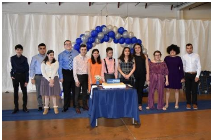
The class of 2020 at their ring ceremony.